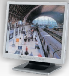
BNC-type video input & output